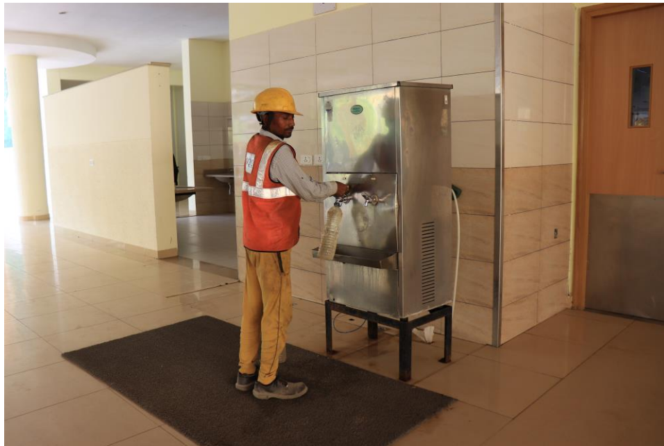
Picture 6: water Facility available for visitors and workers in MUJ Campus